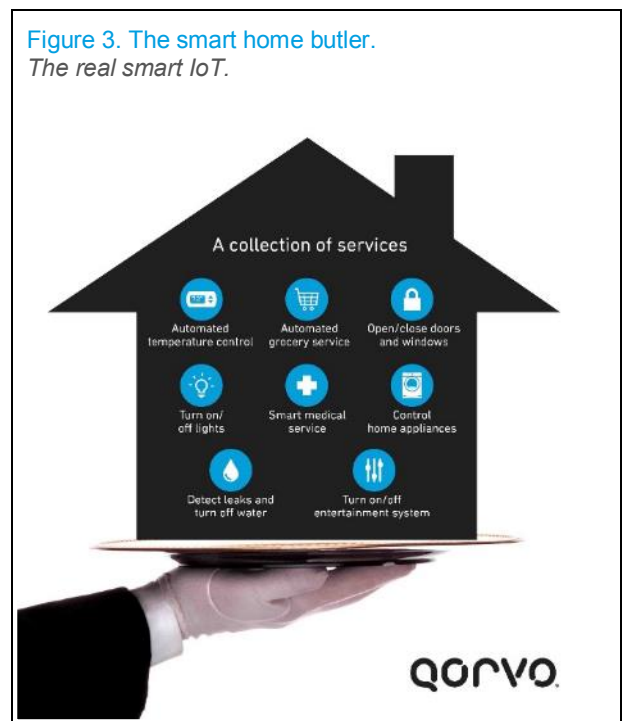
Figure 3. The smart home butler. The real smart IoT.

These four components make SHaaS a reality. Not only is it easy to use, simple to manage, and effective in providing the residents with safety, security and comfort, it also serves as a valuable income generator for service providers.